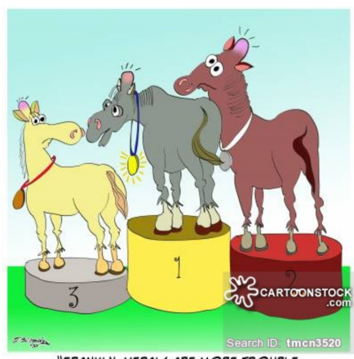
"FRANKLY, MEPALS ARE MORE TROUBLE THAN THEY'RE WORTH. THEY BONK ME IN THE HEAP WHENEVER I TROT."